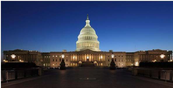
United States Capitol Building where new legislation is being crafted to speed nuclear power along.

In January, the U.S. House of Representatives passed the Advanced Nuclear Technology Act of 2017 , HR 590, that is intended “to foster civilian research and development of advanced nuclear energy technologies and enhance the licensing and commercial deployment of such technologies.” The bill was sponsored by two Republicans and three Democrats and has now moved to Committee in the Senate , chaired by John Thune (R-SD).