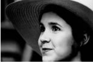
Carrie Fisher Dies at 60