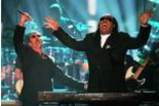
George Michael Dies at 53