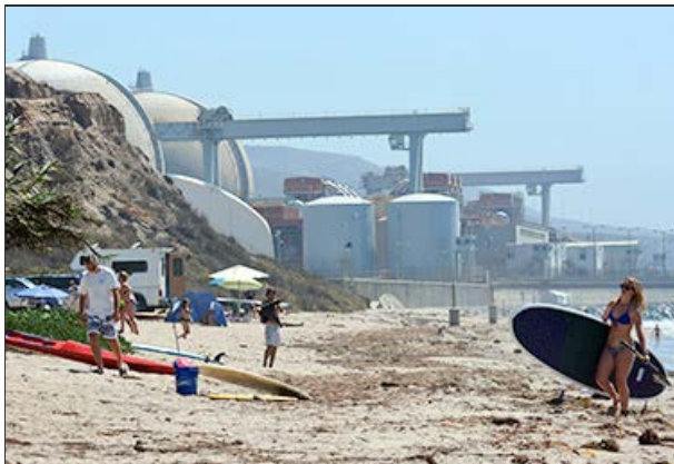
Southern California Edison is in the process of decommissioning its San Onofre reactors on California's coast. The utility is a member of the Decommissioning Plant Coalition and part of a growing string of reactor closures across the country.

Following years would see Southern California Edison join with the closure of the San Onofre reactors in California and Duke Energy Corp. as it shuttered the Crystal River nuclear plant in Florida.