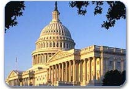
U.S. Congress.

The Department of Energy (DOE) requested legislation in Congress that would tighten secrecy on the Yucca Mountain Project. House Republicans inserted such a provision into a House defense authorization bill. The provision would increase DOE control over unclassified security-related aspects of nuclear waste storage facilities.