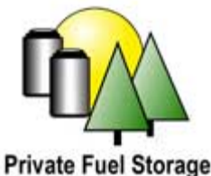
Private Fuel Storage